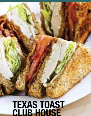
TEXAS TOAST CLUB HOUSE