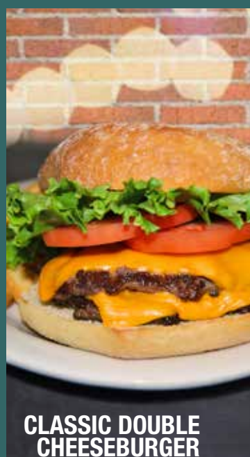
CLASSIC DOUBLE CHEESEBURGER