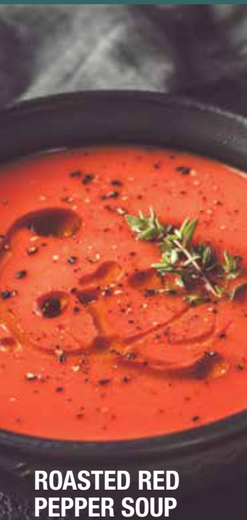
ROASTED RED PEPPER SOUP